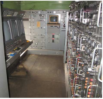
IWM Duxford's MK2A LCP