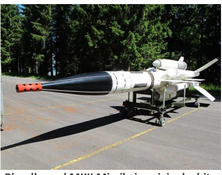
Bloodhound MKII Missile in original white Swiss BL-64 Museum