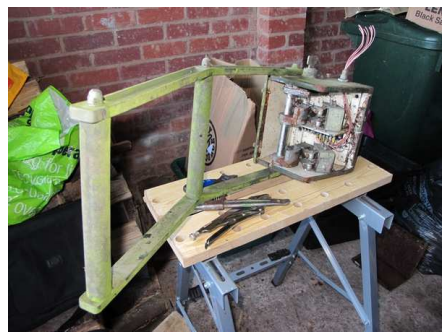
Roof Ladder in the 'Workshop' In the photograph above the 'new' Castell Key is protruding from the top of the roof switch box.

Fortunately the BMPG had access to a derelict T86 which still had its Castell Key in position on the roof ladder. Neil Cartman took charge of salvaging the key and installing it in the BMPG's roof ladder switch box. Not a straight forward task as the switch mechanism also had to be changed.