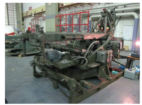
BACT - MKII Type 202 Launcher In the above photo; note the illuminated bulbs in the 'Fault Locating Indicator Assembly', power on!

The BACT purchased their MKII missile and launcher from MOD at the end of Bloodhound in the UK. The launcher had been stripped of all its assemblies (as had their MKII missile), power pack, hydraulics etc. The launcher looked the part but all the attached assembly boxes were empty. A year ago a full set of launcher assemblies were donated by the Swiss BL-64 museum, the assemblies were surplus and destined for scrap. Over the past year Brian Blestowe of the Bristol Aero Collection Trust has been re installing the missing assemblies to the launcher with the objective of restoring the main electrical circuits and the hydraulic system.