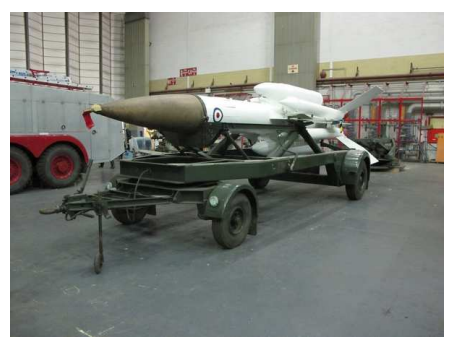
MKI Missile on Trailer

In the next issue of the newsletter it is hoped to have reports from various museums on their Bloodhound exhibits and from other Bloodhound restoration projects underway. Notable among these is the Flying Club at North Coates who are restoring MKI missile for display there. In the meantime here is photo of BACT's MKI missile on an original MKI missile trailer.