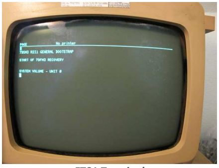
FT81 Terminal Connected to the Argus Test Rig

Initially all was going well with the FT81 but after a period of use the FT81 became unreliable. One FT81 test allows a key press repeat on the screen and key presses would work initially but then stop. The fault was eventually found to be a CMOS device on the keyboard which was replaced. The FT81, with its keyboard operating correctly, is now connected to the test rig and working correctly.