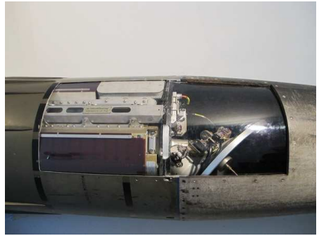
MKII Missile Electronics and Guidance Pack