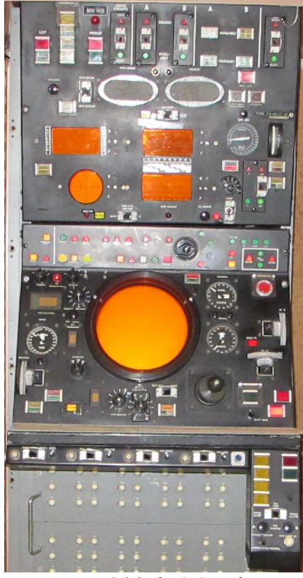
MKII – Original E.C. Console

The following photograph is of the early version of the MKII console at the BL-64 museum.