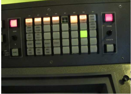
Missile 7, green 'No Fault' It should not be on!

One of the first tasks in carrying out a staged power up of the LCP was to reinstate the -24 Volts DC lamp power supply in the display console and press the Test Lamps button. Surprisingly most of the 28V pea bulbs used in the indicating lamps still worked. Unfortunately one set of lamps were 'on' when they should be 'off', namely the No Fault indication for Missile 7. Initial fault finding shows the fault to be within the top switch panel itself rather than any external unit. The top switch Panel will now be removed from the LCP on the next working day. It is a case of then finding the short that is providing the earth path for No Fault on Missile 7.