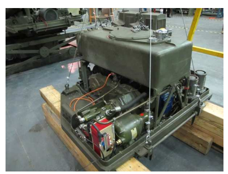
MKII Launcher - Hydraulic Pumping Unit

The Hydraulic Pump Unit has been removed from the launcher for refurbishment work to be undertaken on the main structure and hydraulic lines within the launcher. The Low Pressure Pump has been operated temporarily and consideration is now being given to renewing the hydraulic fluid before progressing further.