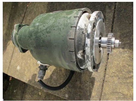
T86 Elevation Motor after Removal and Cleaning

Drive Motor. The motor, being exposed to the elements, was very likely corroded. The only way to establish this was to remove the elevation motor from the aerial assembly.