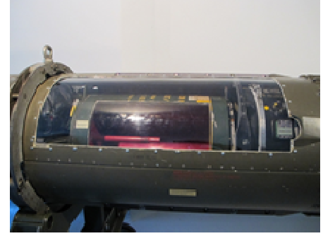
MKII Missile Warhead and Fuze

Further identification of the missile's components and their function would be welcome. Please email contact@bmpg.org.uk.