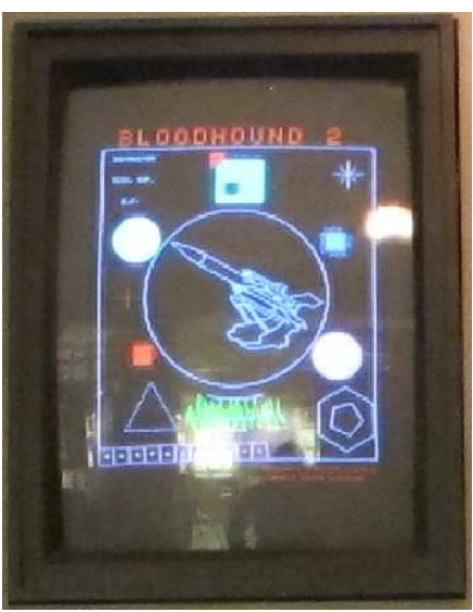
Bloodhound MK2A Boot Screen (Apologies for the glare)

The test rig has now been developed to a point where the Argus 700 computer boots and the four chassis contain the input, output, analogue and CHARGE display cards can be connected to the Argus 700. It was hoped that the test rig would enable a boot of the Argus 700 to be displayed on one of the console display screens, the first step for a power up of the simulator.