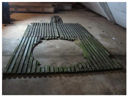
T86 Roof Decking Laid Out after Removal The cabin roof decking has been removed from the T86, leaving it in position would have posed a hazard.

The wooden roof decking had badly deteriorated due to its many years exposed to the weather. In parts the decking was completely rotten. Replacing the decking is a priority as access to the T86 roof is required for working on the corrosion to the lower roof level and the aerial assembly.