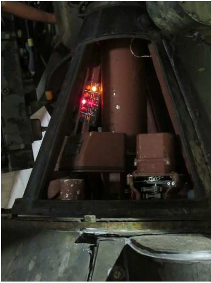
-24 Volts DC on the Aerial

Releasing the T86 aerial brakes requires two separate -24 Volts DC supplies from two power supplies, one in F Rack and one in the console – D Rack. The original power supplies were not serviceable as a visual inspection showed the large electrolytic smoothing capacitors had blown pressure seals and leaking dielectric. To provide the required DC power two commercially available 24 Volt power supplies were connected to the circuit on a temporary basis. Mains voltage was then connected to the 24 Volt power supplies, again on a temporary basis. When the two 24 Volt supplies were switched on, the roof safety switch and the aerial brake switches on the console applied, there were two separate 'clunks' from the aerial assembly as the bearing and elevation brakes were released for the first time in at least twenty two years.