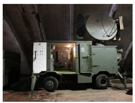
BMPG's T86 Ser. No. 501

The main corrosion problem was found on the lower section of the roof at the base of the aerial pedestal where it joins the step to the higher roof section. In several parts corrosion had eaten through the steel roof. The T86 cabin is mainly of aluminium alloy, except for the steel roof section around the base of the aerial pedestal. It is assumed that steel was used as welding was required in fitting this roof section around the circular pedestal base. Repair of the corroded sections has yet to be carried out. The level of corrosion is not serious and does not warrant replacement of the roof, or any part of it.