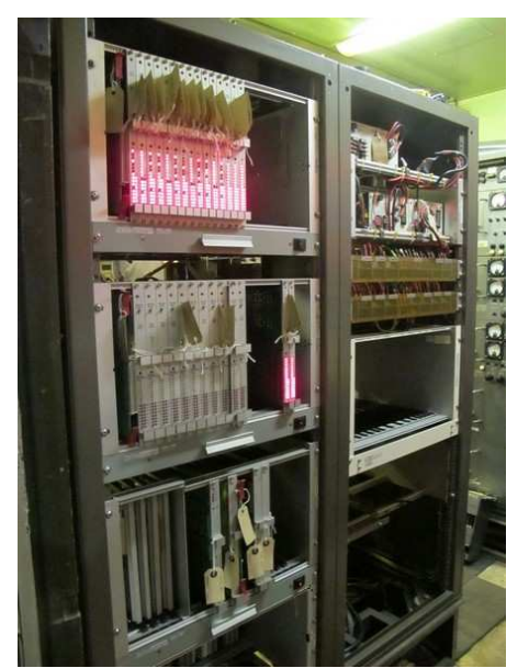
Power Supplies for the Digital Input and Output Chassis Reinstated

The current task is to ensure as much of the computer racks, of which there are two, and the display console is working before the Argus 700 is reinstalled.